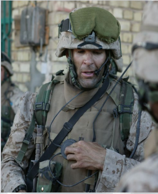
War Hammer 6